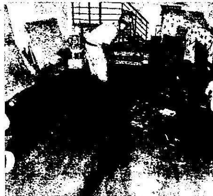
A home in Koramangala ST bed area.