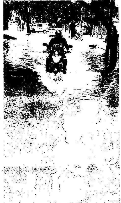
A road in the Koramangala ST bed area.

to increase the carrying capacity of SWDs in the city would be taken up seriously. "We will ensure that more recharge pits are built and regular desilting of SWDs," he said.