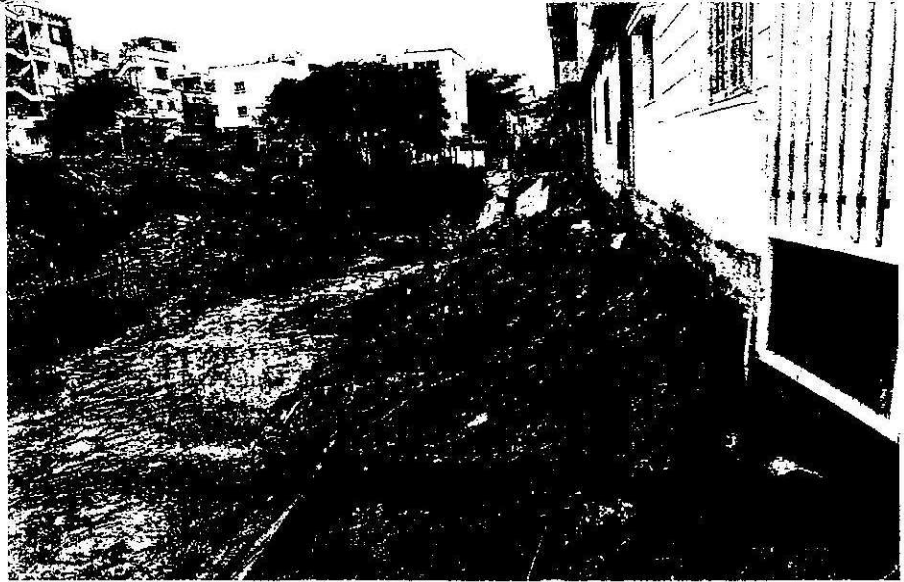
A portion of a retaining wall of an SWD collapsed in Gurudatta Layout near Hosakerehalli on Tuesday night. ■ K. MURALI KUMAR

The area of the collapse is a revenue site. Deputy