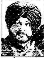
Navjot Singh Sidhu

CHANDIGARH, PTI: Congress leader Navjot Singh Sidhu, who has been at loggerheads with Punjab Chief Minister Amarinder Singh and was