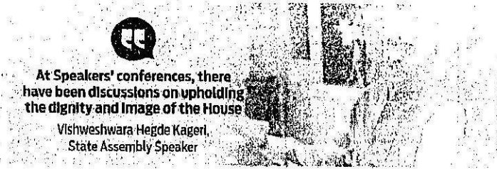
At Speakers' conferences, there have been discussions on upholding the dignity and image of the House