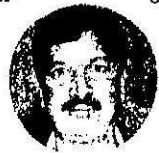
Basavaraj Bommai, Home Minister

The preliminary probe will be taken up based on Ramesh's letter and if the SIT deems it fit, it can register a First Information Report (FIR) based on the findings during the initial probe and continue further investigations.