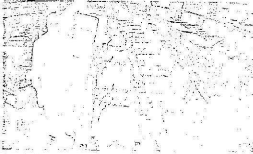
Speaker Vishweshwara Hegde Kageri inspects the Assembly hall ahead of the winter session. (HAGARAJA GATEKAL)

Of the seven days, regular sessions, including Question Hour, will be held on five days while the last two days have been reserved for a discussion on 'One Nation, One election'. As many as 10 bills are expected to be tabled and the government will be hoping to get lucky with their passage. A discussion on the proposed love jihad law can also be expected to raise the heat. P3