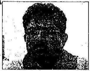
Minister R Ashoka

Encumbrance certificates and booking of appointments to register property documents