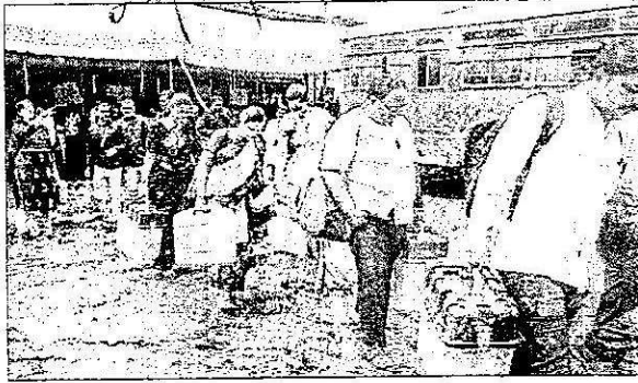
Election officials leave for their respective polling stations from a distribution centre in Sangli on Sunday.

The campaigning saw Prime Minister Narendra