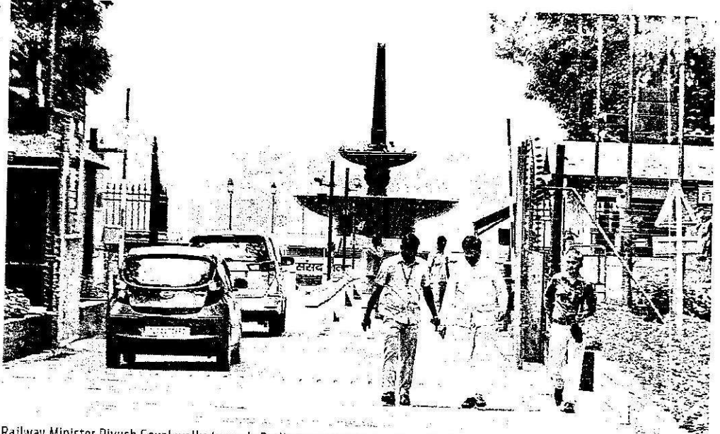
Railway Minister Piyush Goyal walks towards Parliament main gate after a faulty security alarm went off

The Lok Sabha on Friday passed amendments to National Human Rights Commission Bill that curtails the tenure of the chairperson and members from the current five to three years. The Bill stipulates that former Supreme Court and high court judges could also become members of the NHRC. Currently, former CJIs could become the members and chairperson of the body.