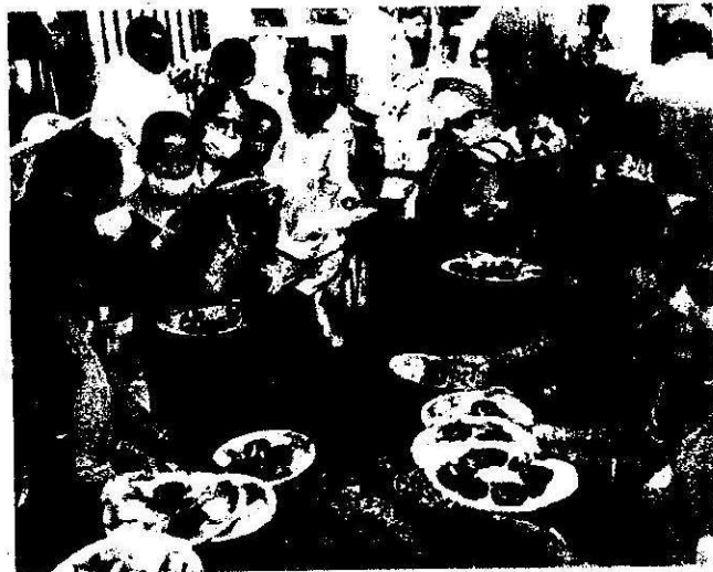
FOR REPRESENTATIVE PURPOSE