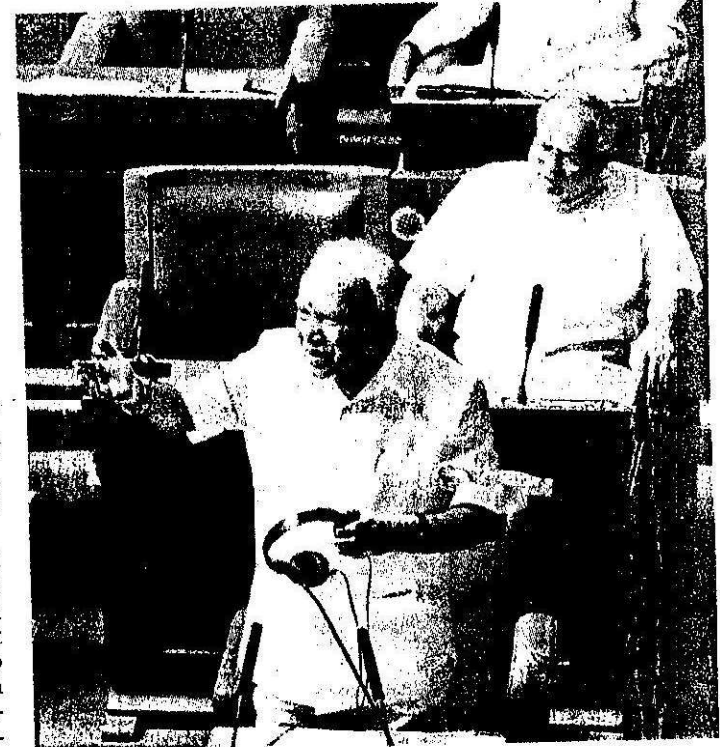
Chief Minister BS Yediyurappa during the assembly session at Vidhana Soudha on Wednesday. He will present his 7th budget on Thursday

Sources said that the budget may have many sops for North Karnataka, which has been Yediyurappa's main support base. Expectations are also high on farmers getting a waiver on the interest component of loans, and continuation of the Badavara Bandhu scheme, launched by the Siddaramaiah government.