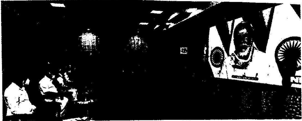
In a video conference, Prime Minister Narendra Modi addresses CM B S Yediyurappa, Governor Vajubhai Vala and others at the 25th Foundation Day celebrations of the Rajiv Gandhi University of Health Sciences in Bengaluru on Monday

ಪತ್ರಿಕೆಯ ಹೆಸರು : NAME OF THE NEWS PAPER: Indian Express ದಿನಾಂಕ : DATE : 21/6/2020