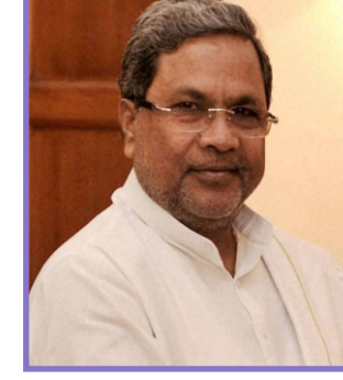
ಸನ್ಮಾನ್ಯ ಶ್ರೀ ಸಿದ್ದರಾಮಯ್ಯ ಮಾನ್ಯ ಮುಖ್ಯಮಂತ್ರಿಯವರು ಕರ್ನಾಟಕ ಸರ್ಕಾರ